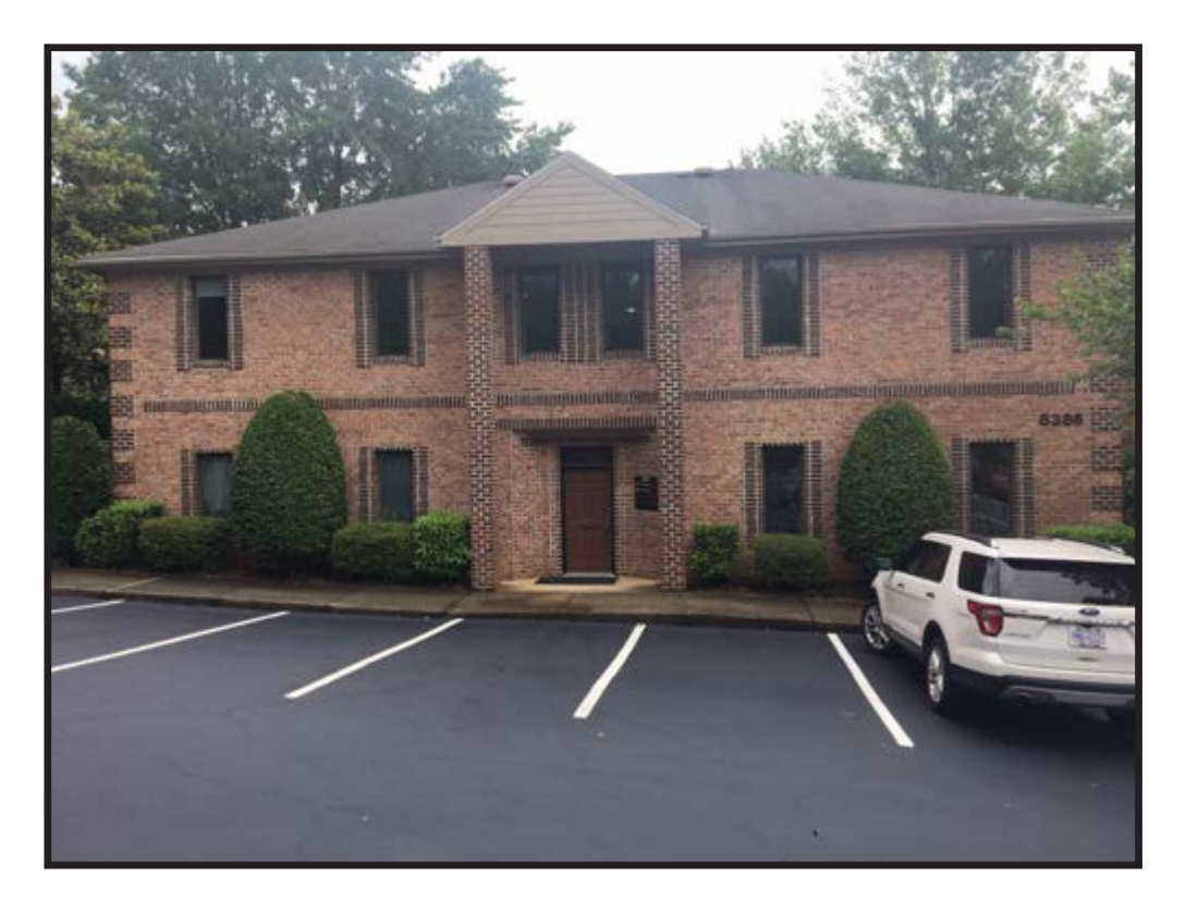
8386 Six Forks Road, Raleigh, NC 27615